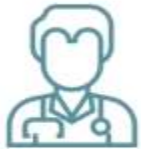
FIRST CONTACT DOCTORS

INTEGRATED INTERNET PLATFORM CONNECTING PATIENTS WITH: